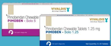
PIMOGEN - Solo 3 x 10 tablets