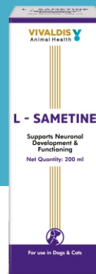
L - SAMETINE 200 ml