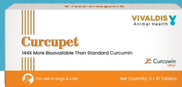
Curcupet 3 x 10 tablets