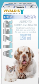
ALZER 150 ml