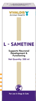
L - SAMETINE 200 ml