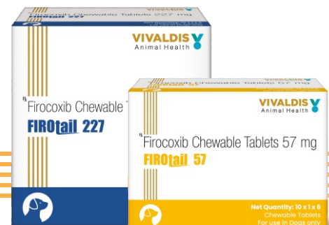
FIROtail Firocoxib Chewable tablets 57 / 227 mg 10x1x6 tablets