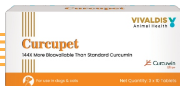
Curcupet 3 x 10 tablets